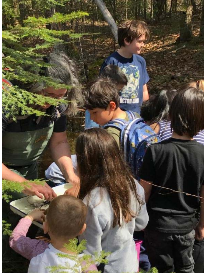
April's Vernal Pool Exploration