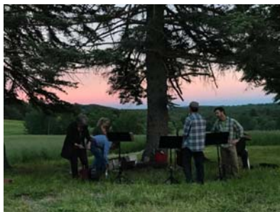
The Contra Banditos

If you haven't been to The Great Road Kitchen, make it one of your summer treats for fresh seafood and a warm, neighborly atmosphere.