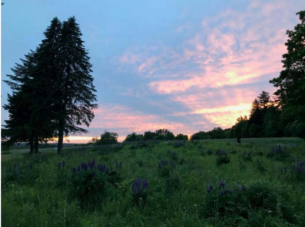
Early spring sunset at The General Field