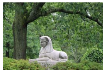
The Sphinx outside Bigelow Chapel at Mt. Auburn