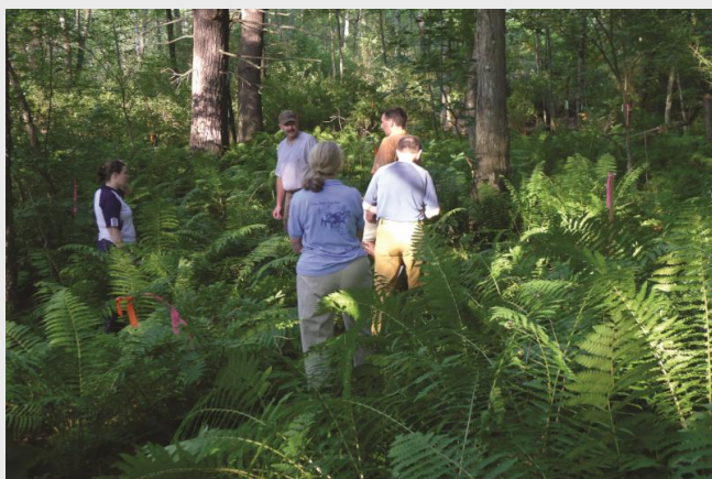
Trustees and interns work on Bates Land.

GCT has taken a leadership role by developing and field-testing control techniques that can be used by land trusts across the state. The Community Foundation of