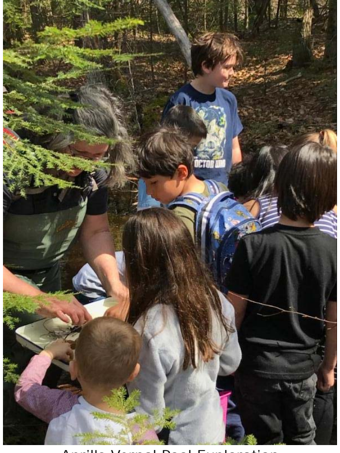
April's Vernal Pool Exploration