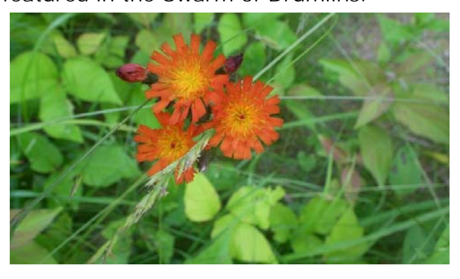
Harlan is Found!

Check out our <u>website</u> for great activities featured in the Swarm of Drumlins.