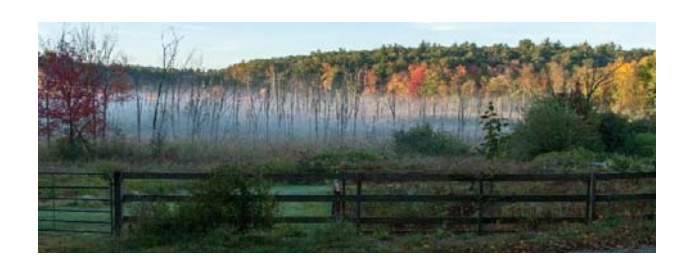
The Lotz Land will be formally dedicated on Sunday, August 9 at 10:00 AM.