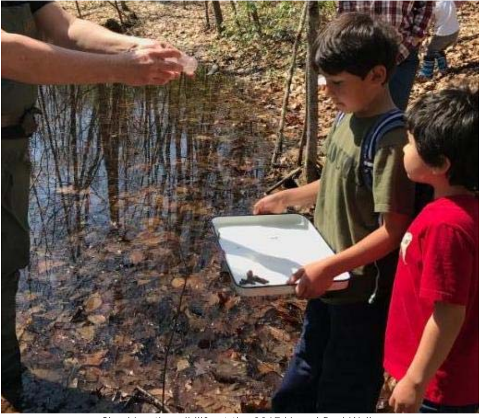
Checking the wildlife at the 2017 Vernal Pool Walk.